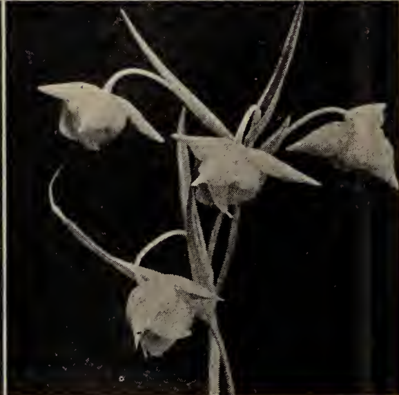
Calochortus Maweanus Major